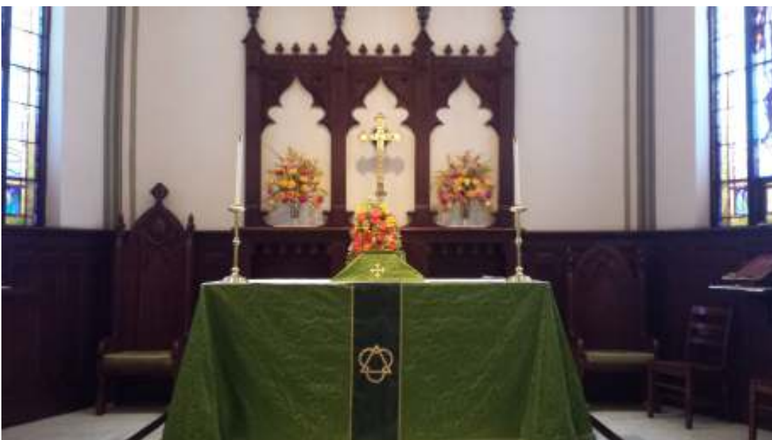
The Frontal is Jacobean in style and is the green damask cloth covering the altar table. The Fair Linens are the white cloths on top of altar table. They are embroidered with five crosses.