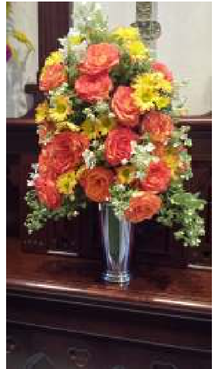
The Pewter Vase will be used in the Pilgrim's Chapel.