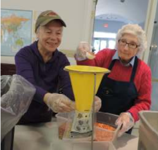
Stop Hunger Now