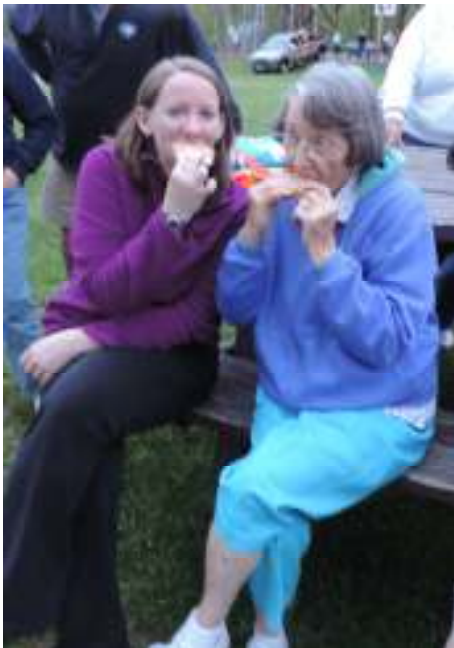
S'mores at Shrine Mont