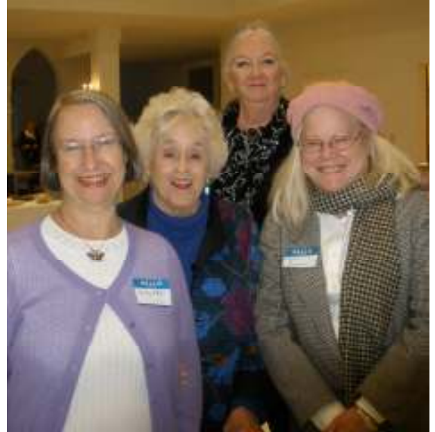
Treasure Box 55th Anniversary