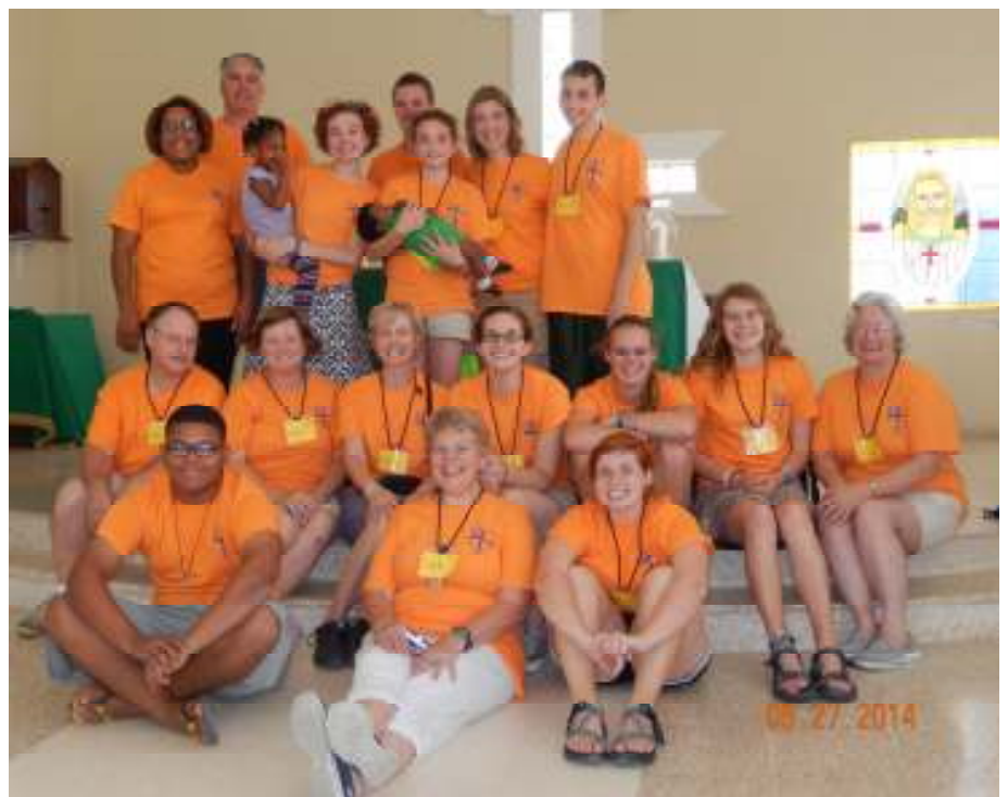
DR Mission Team