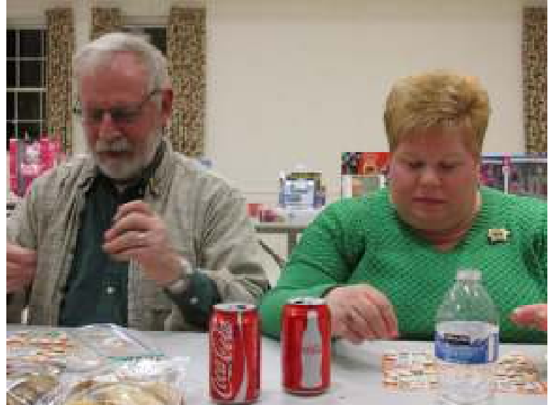
WATTS Bingo Night