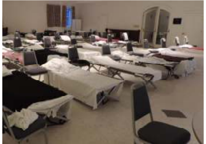
The Tilford Room set up for WATTS last winter