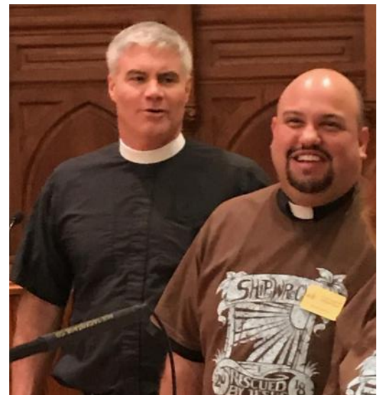
Vacation Bible School July 16-20, 2018